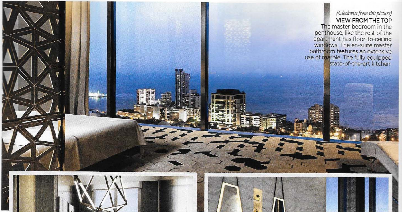
(Clockwise from this picture) VIEW FROM THE TOP

The master bedroom in the penthouse, like the rest of the apartment has floor-to-ceiling windows. The en-suite master bathroom features an extensive use of marble. The fully equipped state-of-the-art kitchen.